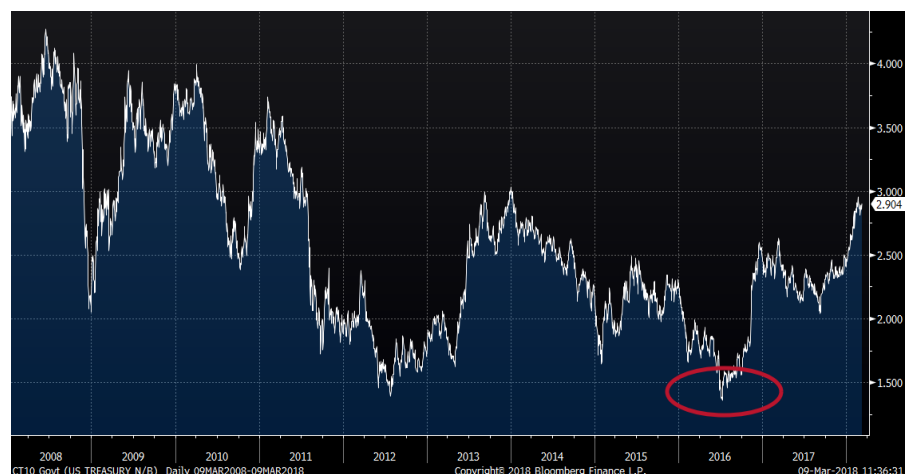
CHART 1: 10-Year T-Note Yield (Daily Mar. 9, 2008 – Mar. 9, 2018)

10-year T-note yield troughed roughly 3 weeks after inflation expectations troughed. The sizeable flows into fixed-income investments ran unabated until only recently despite the increase in yields.